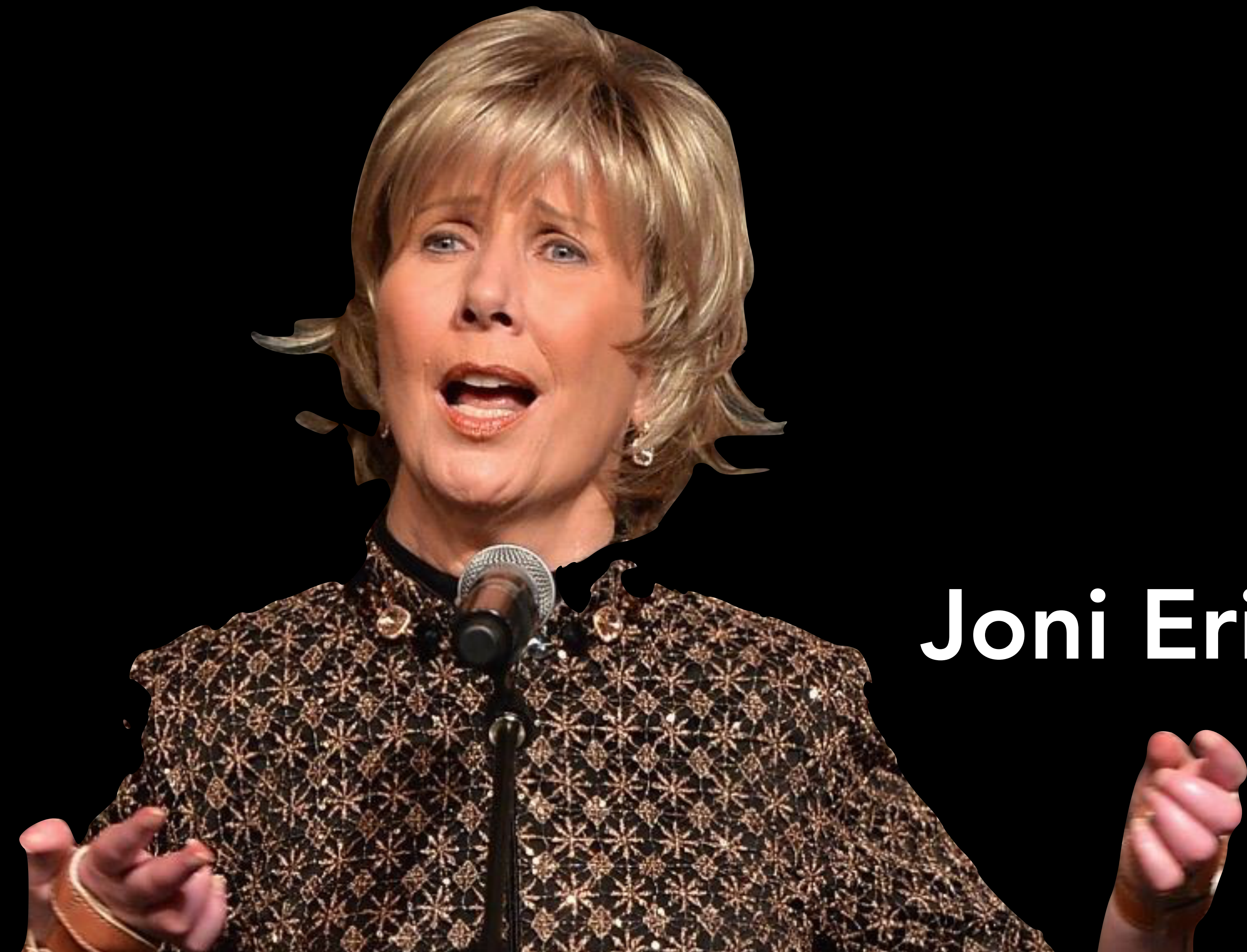
Joni Erickson Tada