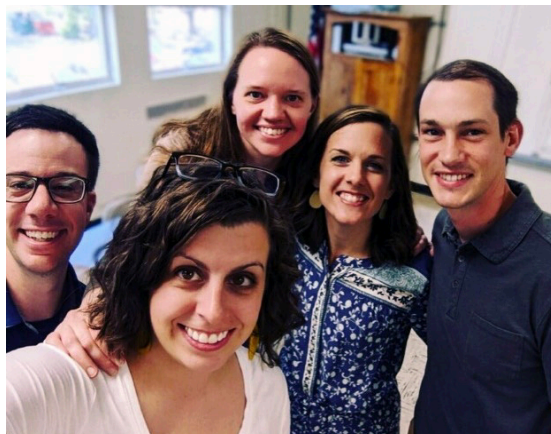
Connecting with friends at King Street Church