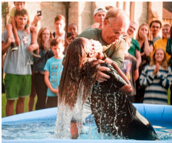
Baptism during the final night of 21 Project

upon returning home. Then I had strong sense of the fear of the Lord over what He had invited us into and entrusted us with. I realized that so many moms and dads in the faith had been praying for this, believing for it, giving their lives to see a generation rise up in unity, boldness, and passion for Jesus. And here we were, just a group of Americans that said yes to God and He added us right into this incredible story He is writing in Europe.