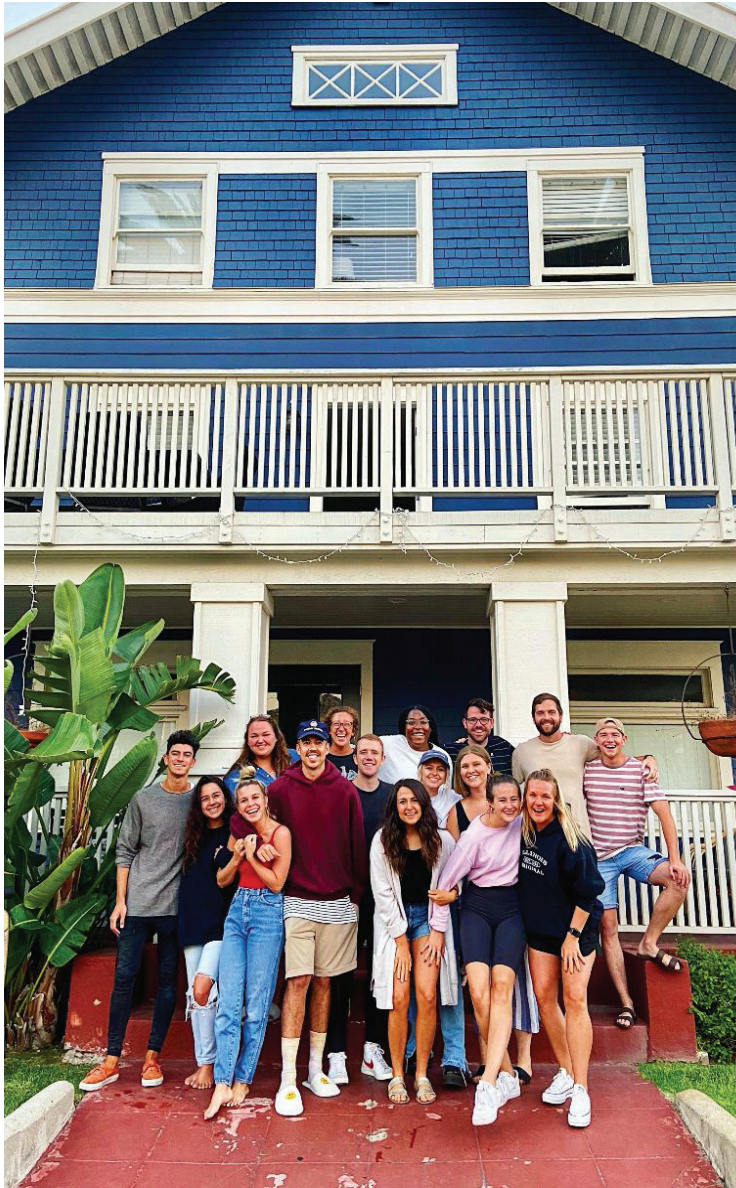
A small group of Circuit Riders that lives at the Evangeline

Circuit Riders that live at the Evangeline, the big blue house behind us! CR has rented this house for years and it is definitely a sign of home to all of us. I lived here when I first arrived back from Europe in March. It was so refreshing to see everyone after so many months of quarantine. The Evangeline is downtown, so all around us people were setting off fireworks, sparklers, etc. A group of us grabbed bikes and longboards and rode around the night of the 4th watching them all go off. It was really cool, too, because