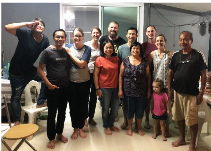
"Goodbye, church family"

Well, this is it. We have cleaned out our house, packed, sold or shipped everything from our lives here, and we are saying our last good-byes before getting on the plane on December 1.