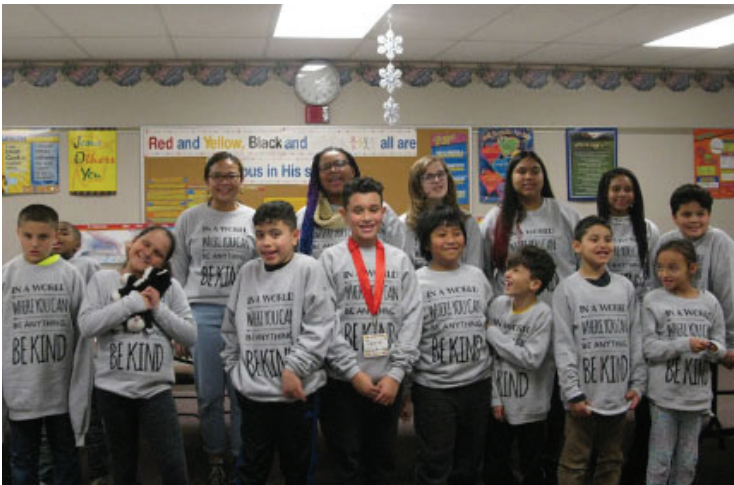
Photo of some After School Program students taken last winter

good news is that many of those children are taking advantage of the school program we are running for those who need help with their virtual learning. More good news ... due to your generosity, we will be able to provide a nice gift for our families for Christmas.