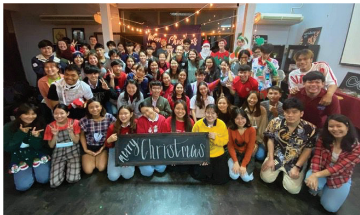
University students enjoying a Christmas party

We had a Christmas party and the Gospel was clearly presented. We have been able to read about the birth of Jesus with many students this month and many girls seem interested in reading the Bible again. Please pray for more opportunities to read the Bible with students.