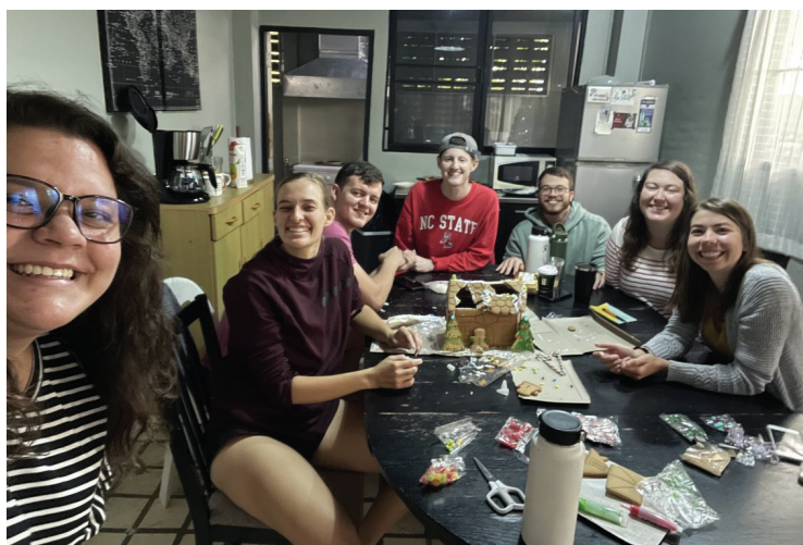
Building a gingerbread house