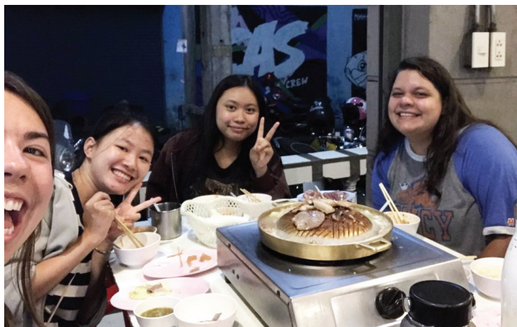
Last dinner with some students

(Serving in Chiang Mai, Thailand with Campus Outreach International)