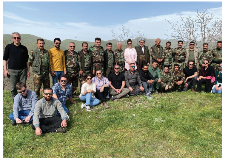
Photo with members of the Peshmerga

Easily one of my highlights from our time in Kurdistan was the opportunity we had to meet and spend time with members of the