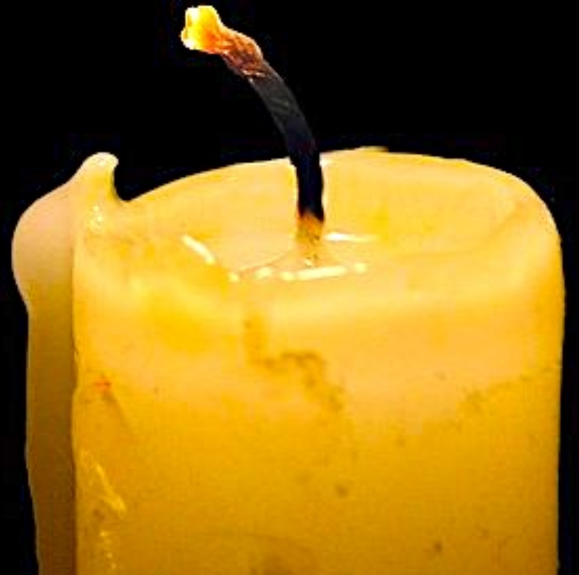
A Smoldering Wick