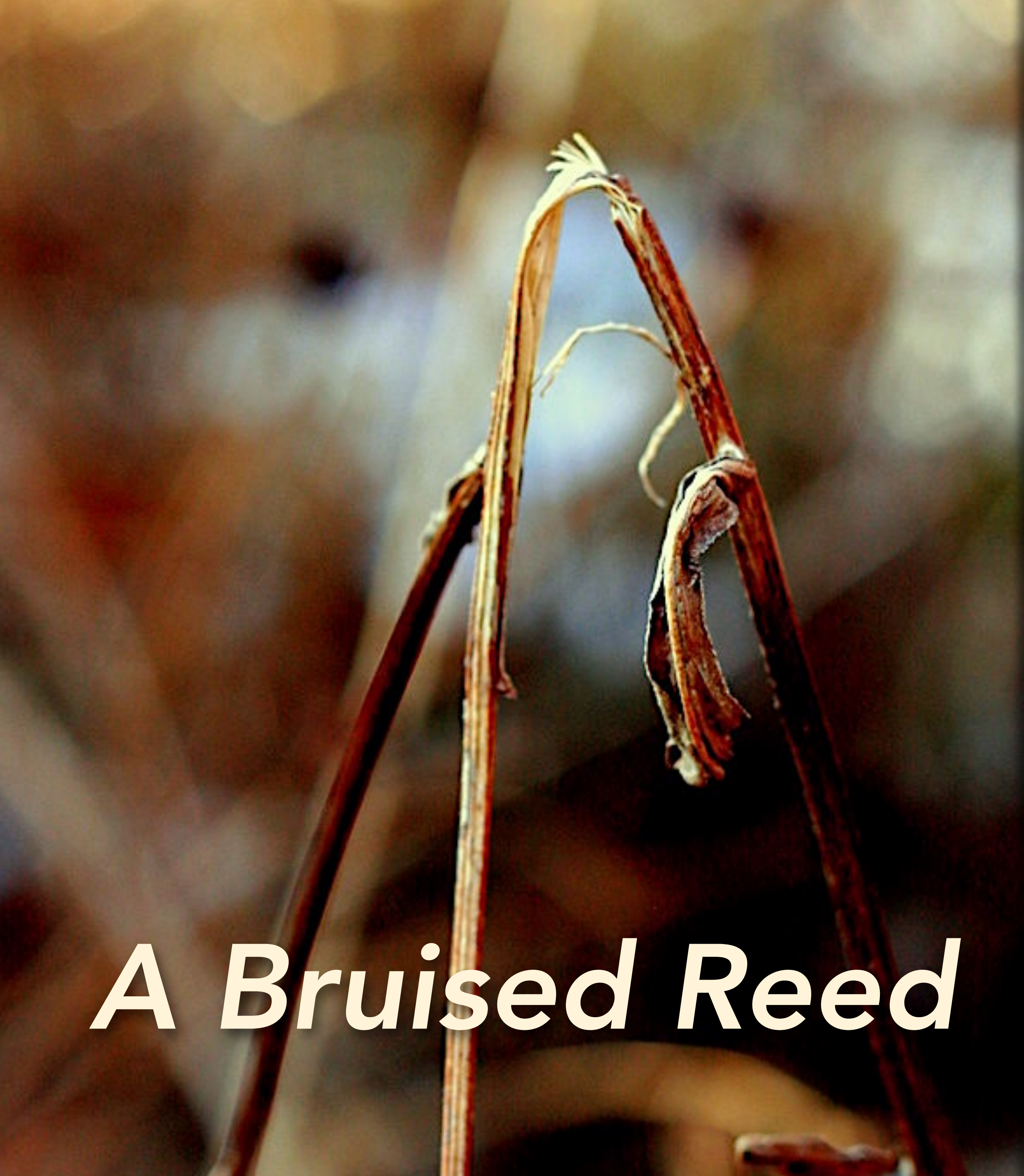
A Bruised Reed