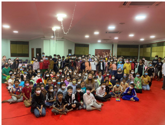
Christmas Party Group Photo

• Through providing volunteers: With all four grades combined, we have around 200 students ... and there are only four of us. There was no way my teammates and I would be able to manage such an event on our own! Thankfully, the Father provided the help we needed through city teammates traveling to the province to help us and through the school providing faculty volunteers. In total we had about 25 volunteers helping us with the party!